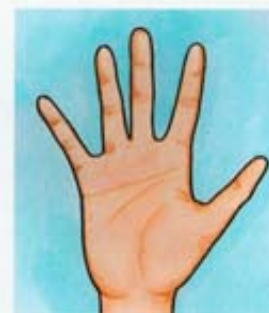
Long palm, long fingers: You're a feeler.